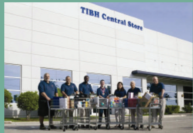
The staff was proud to give attendees a first-hand look at TIBH Central Store products.