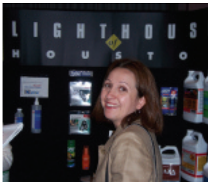
The Lighthouse of Houston displays its products at the Vendor Fair.