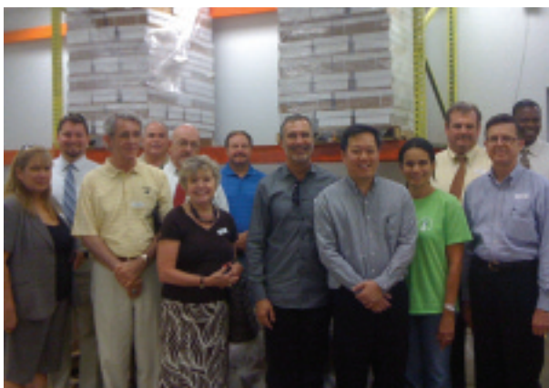
Members of the Texas Council on Purchasing from People with Disabilities and TIBH staff members toured the South Texas Lighthouse for the Blind in Corpus Christi on June 17.