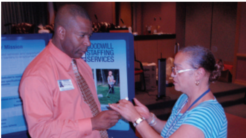
The Vendor Fair allowed one-on-one buyer and CRP interaction.