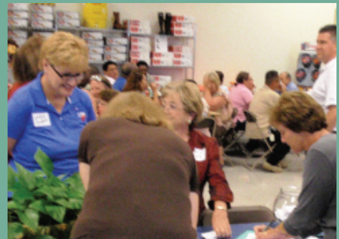
More than 100 customers from various organizations attended the open house.