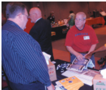
An attendee flips through a catalog and discusses products.