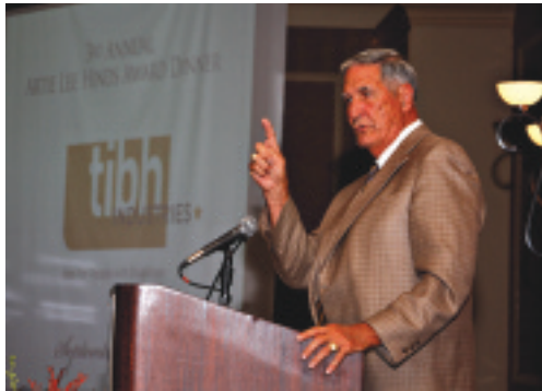
Coach Gene Stallings delivers the keynote address during the 3rd Annual Artie Lee Hinds Award Dinner.

The Artie Lee Hinds Award Dinner, held in honor of TIBH's founder and chairman emeritus, is an evening of great celebration. Event attendees unite and recharge the State Use mission, recognizing vital program participants including purchasers, customers, legislators, the Texas Council on Purchasing